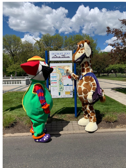
It was a perfect day to explore and get some Vitamin Z!! Schedule your visit today!