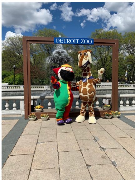
Clownie and his friend Gerry the giraffe having a blast at the Detroit Zoo!!