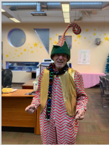
Show us your best Elf pose!