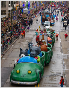
Norm is the hidden driver inside the Strategic Staffing Solutions "Disco Dogs and Cool Cats" float!