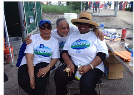
Memories From Detroit River Days